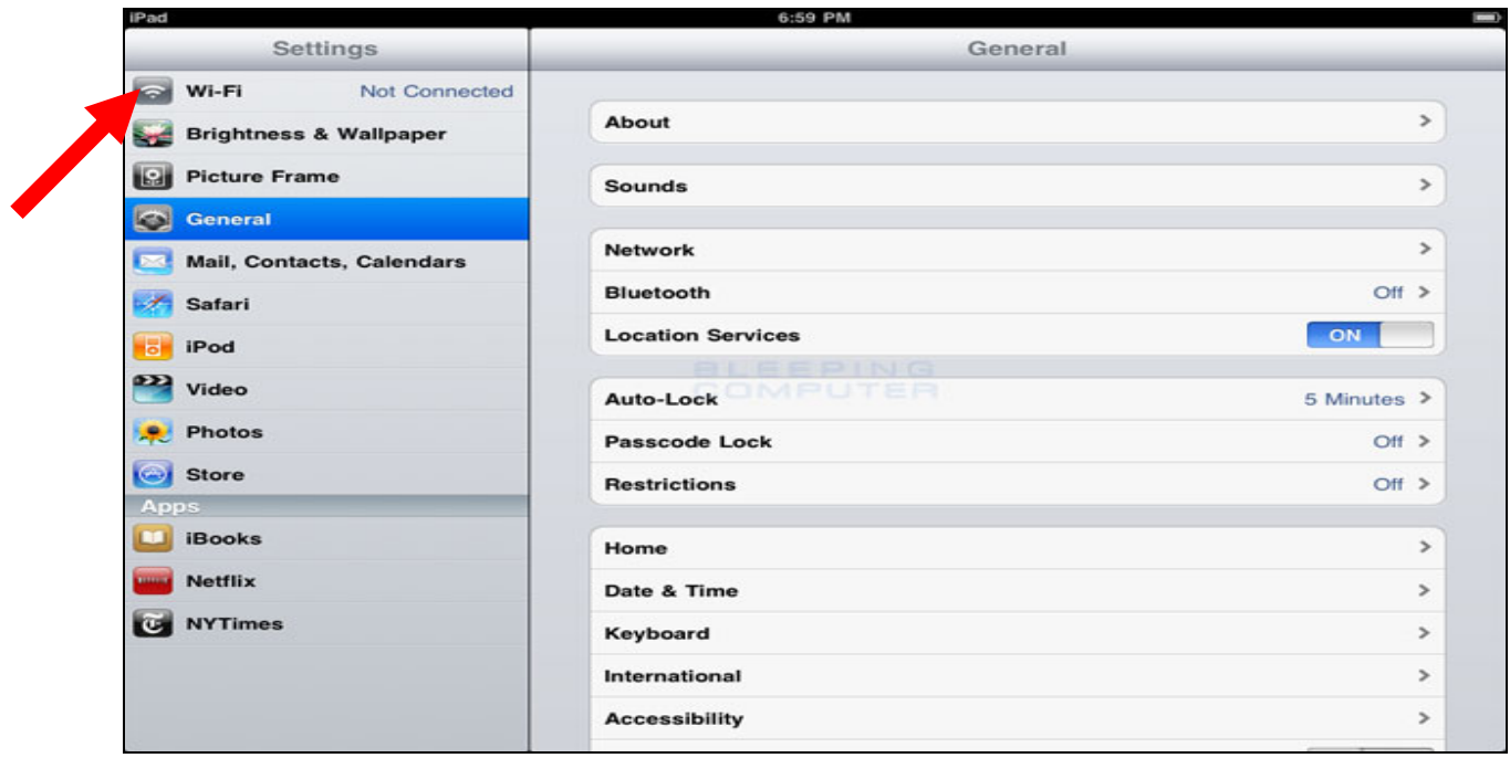
General Settings screen

2. Once in the settings application, you will be at the General Settings screen. Tap on the Wi-Fi category to get to the screen where you will connect to a wireless network as shown below.