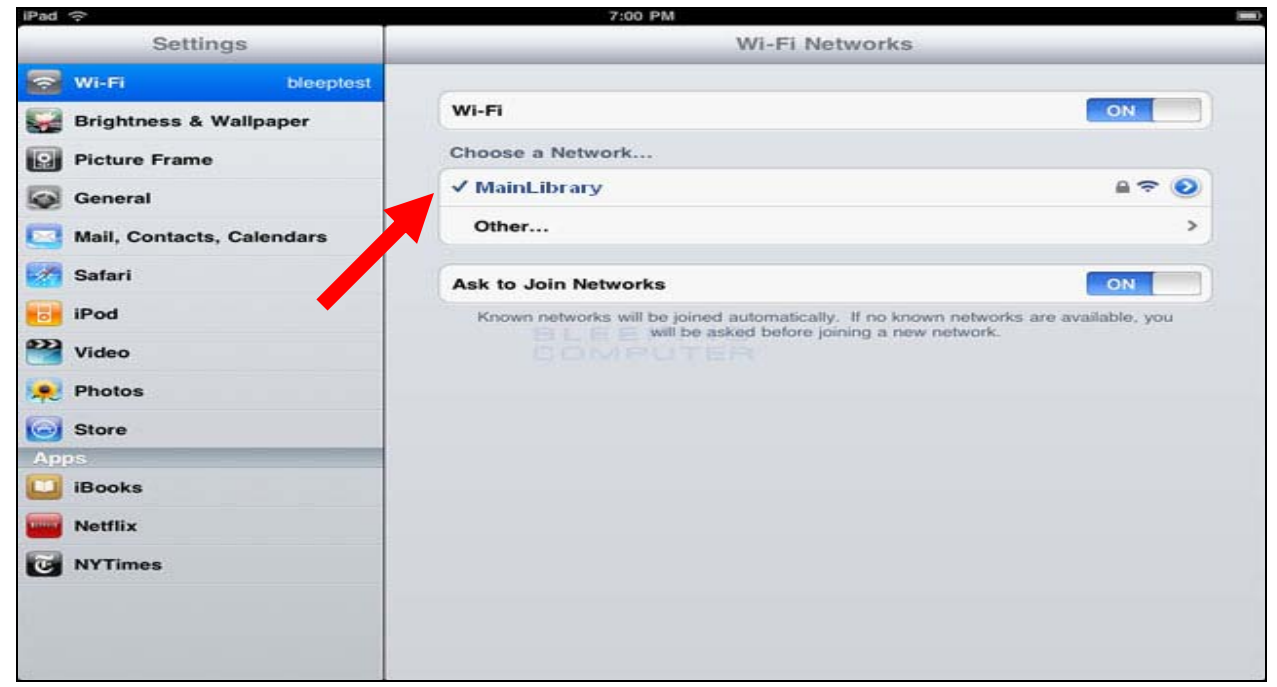
Screen showing the IPad connected to a wireless network

4. The iPad will now attempt to connect to the network, and when finished, will display the Wi-Fi settings screen again, but this time with the joined network listed with a checkmark next to it as shown below.